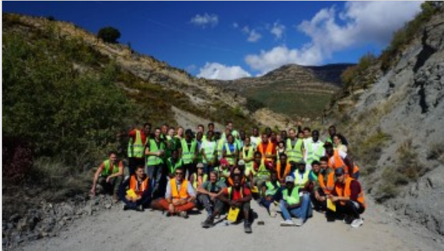
"First-year Master's degree Promotion"